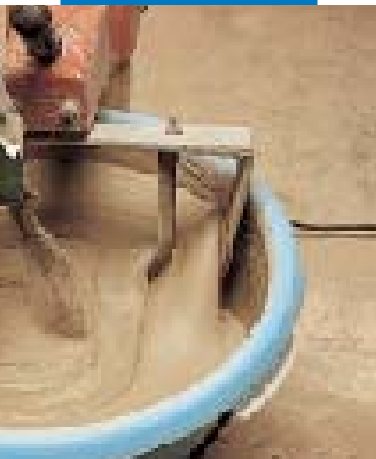
Grey Idrosilex Pronto mixed with water