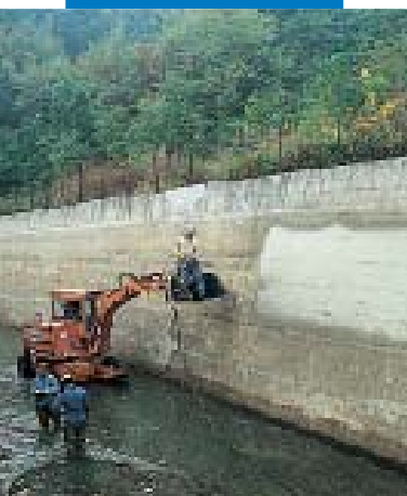
Application of Idrosilex Pronto by spray gun in hydroelectric canal