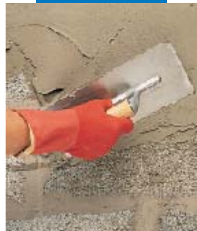
Application of Idrosilex Pronto by trowel