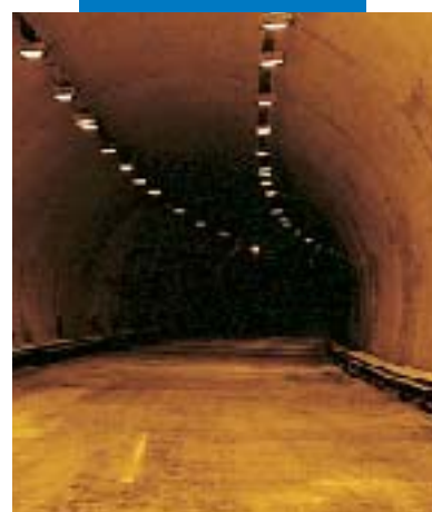
Application of white Idrosilex Pronto by spray gun in highway tunnel