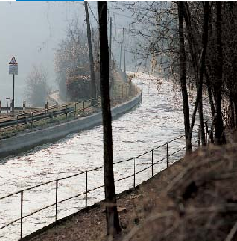
Bertini hydroelectric canal near Como, Italy. Surfaces treated with Idrosilex Pronto

N.B. Although the technical details and recommendations contained in this product report correspond to the best of our knowledge and experience, all the above information must, in every case, be taken as merely indicative and subject to confirmation after long-term practical applications; for this reason, anyone who intends to use the product must ensure beforehand that it is suitable for the envisaged application. In every case, the user alone, is fully responsible for any consequences deriving from the use of the product.