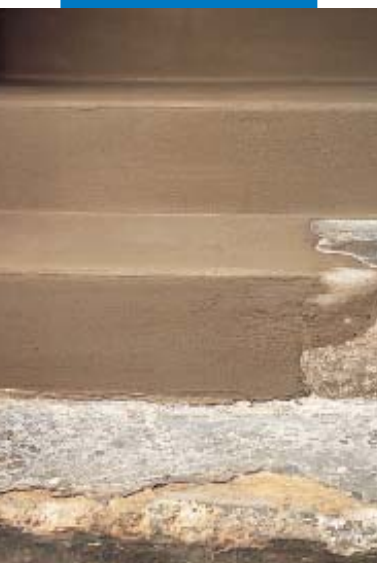
Steps before and after being treated with Nivorapid