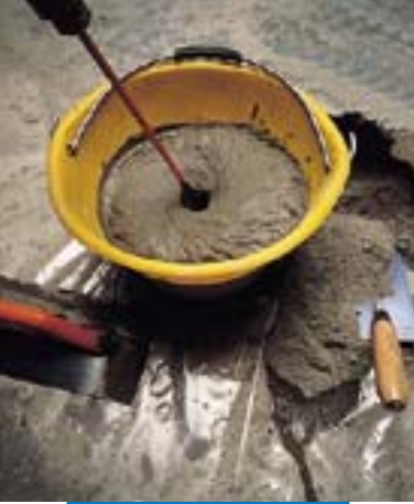
Nivorapid mixed with mechanical mixer