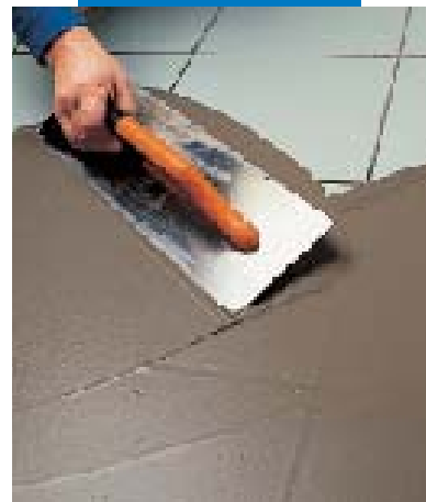
Levelling of existing floor with Nivorapid