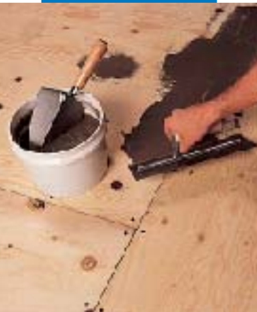
Grouting a plywood substrate with Nivorapid + Latex Plus