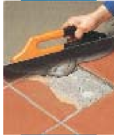
Filling holes with Nivorapid

All relevant references of the product are available upon request