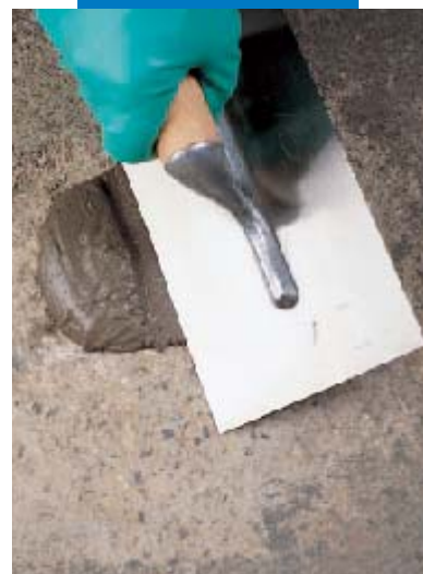
Repairing horizontal arrises with Nivorapid