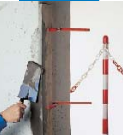
Repairing vertical arrise with Nivorapid